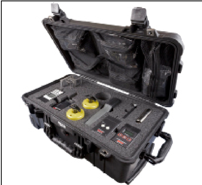
Figure 1. SCS 770045 EOS/ESD Assessment Kit