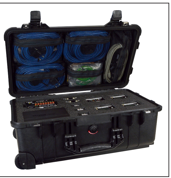
Figure 1. SCS 770050 SMP Diagnostic Kit